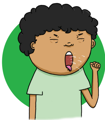
Cough or noisy breathing