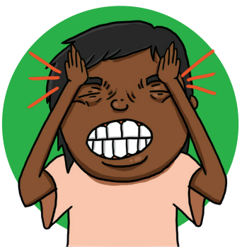
Headache, muscle aches, tiredness