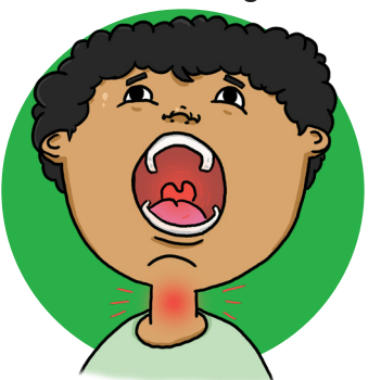
Sore throat and runny nose