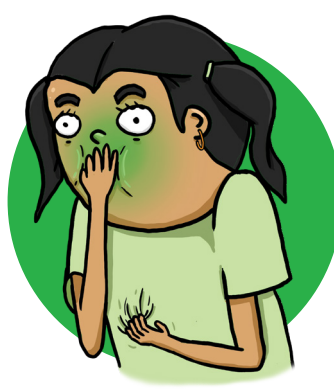
Nausea and vomiting