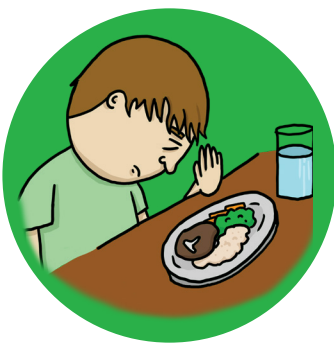
Loss of appetite or poor feeding