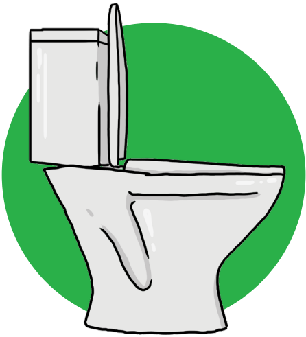
Bub has problems peeing