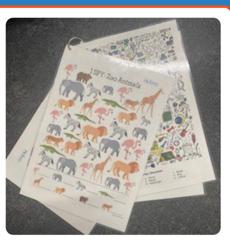
Waiting can be tricky. I can talk with my parent/carer about things I can do while I wait.