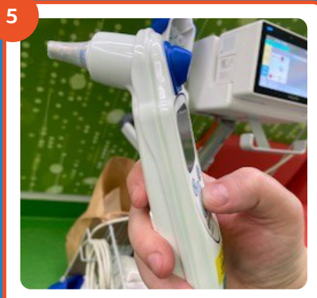
While I am waiting, the nurse will take some observations like my temperature. It's important I stay still.