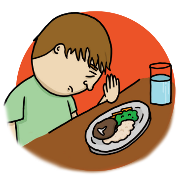
Not eating, have trouble sleeping or no energy