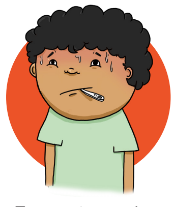
Temperature under 35.5° or over 38° or are hot to touch