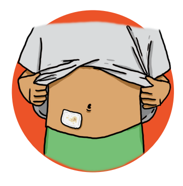
Oooze (wetness) or a bad smell from the wound

If any of these happen it's very important that you go straight to the closest hospital.