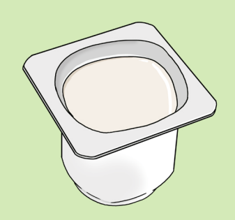
Capsules can be opened and mixed with food such as yoghurt or apple sauce.