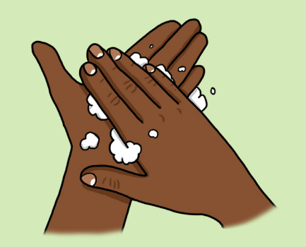
Wash hands before and after giving chemo medications.