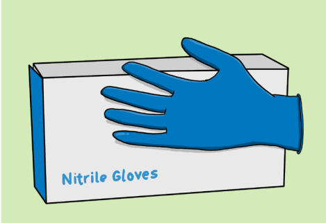
Wear blue nitrile gloves when handling chemo medications.