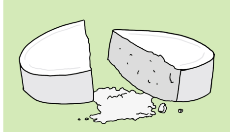
Do NOT crush, break or chew the medication. If bub can't swallow the tablet whole, then it can be dissolved in liquid. See next page.