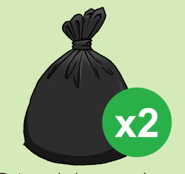
Put used gloves, syringes and caps into double bags and throw them in the bin.