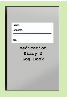
Always bring your diary to hospital.