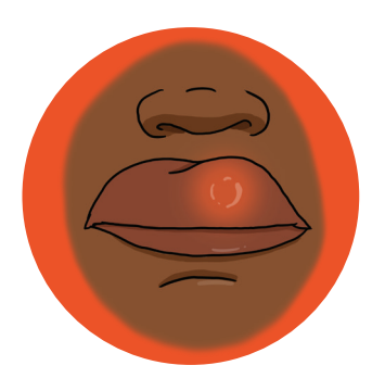
More swelling or redness around their mouth or their lip

See your GP, health clinic or go to the emergency department.