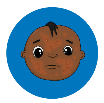
You have had an allergic reaction to a medicine