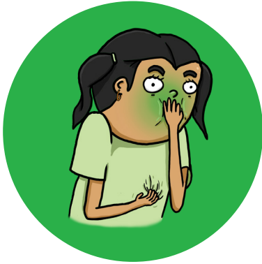
Nausea and vomiting