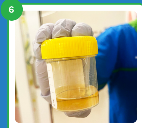
Once the pot has enough wee in it, my parent/carer will put the lid on while I finish on the toilet.