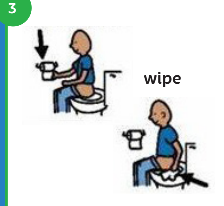
Before I start, I need to wipe so everything is clean. My parent/carer can help if this is tricky.