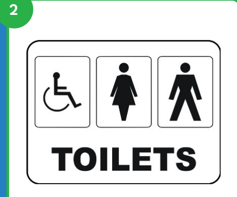
I will need to go to the toilet with my parent/carer who will be able to help with this job.