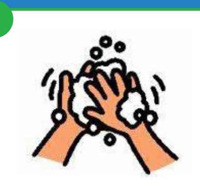
Once I am finished on the toilet, I will wash my hands before returning to the Emergency Department.