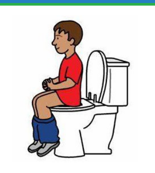
The first bit of my wee will go straight into the toilet bowl, then my parent/ carer will move the pot underneath to catch the next bit.