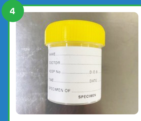
Now I need to start my wee. My parent/carer will need to be ready with a small pot to catch some of my wee for the sample.