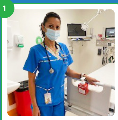
My doctor/nurse has told me that they need a sample of my wee (urine).