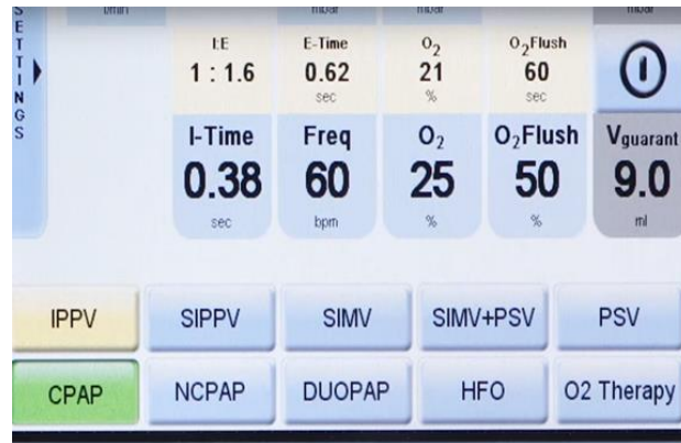
Modes of ventilation screen (Fabian)